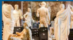
Rescued from the Seine: Louvre artworks rescued from flooding in Paris.

Climate change and the threat to our cultural heritage