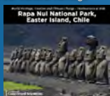
Rapa Nui National Park, Easter Island, Chile