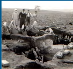
Swedish Cyprus Expedition, 1927-31